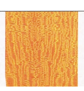
Mahogany Quarter sliced 2-piece, book matched