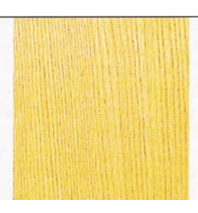
Oak, white Rift-cut