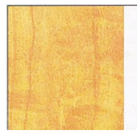
Cherry Flat-sliced 2-piece, book matched

The grain pattern and figure on the face of the veneer are of the utmost importance to the designer and architect, since the whole character of the completed installation may be determined by the choice of veneer to be used. Veneer men, in discussing figure in the wood, usually describe the characteristics of the 'movement' in the wood, whether it has wide heart, narrow heart, cathedral, crossfire, or is highly figured.