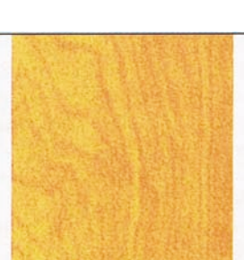
Oak, white Flat sliced