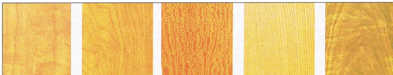
Cherry Flat-sliced 2-piece, book matched

The grain pattern and figure on the face of the veneer are of the utmost importance to the designer and architect, since the whole character of the completed installation may be determined by the choice of veneer to be used. Veneer men, in discussing figure in the wood, usually describe the characteristics of the 'movement' in the wood, whether it has wide heart, narrow heart, cathedral, crossfire, or is highly figured.